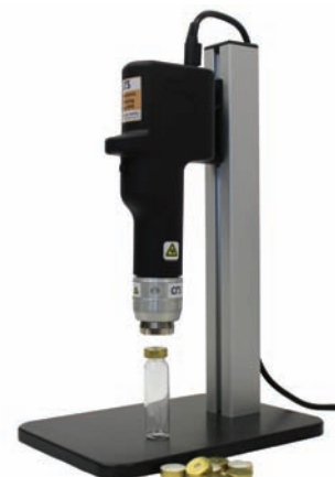
Base and Mounting Kit