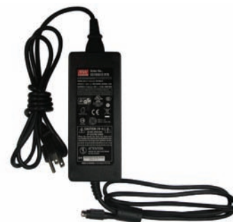
Power Cord and Supply