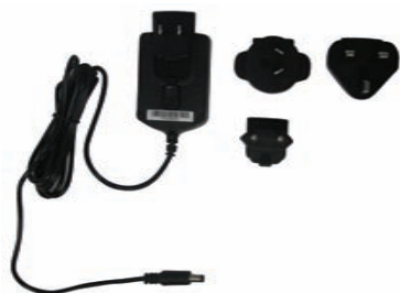
Power Supply and Plug Set

The tools can be recharged in one to two hours with the universal power supply included. The power supply includes a plug set for operation in most countries.