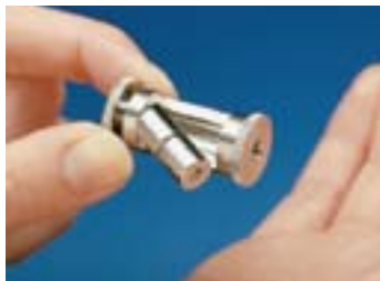
Alltech® All-Guard™ System—change cartridges in seconds without tools.